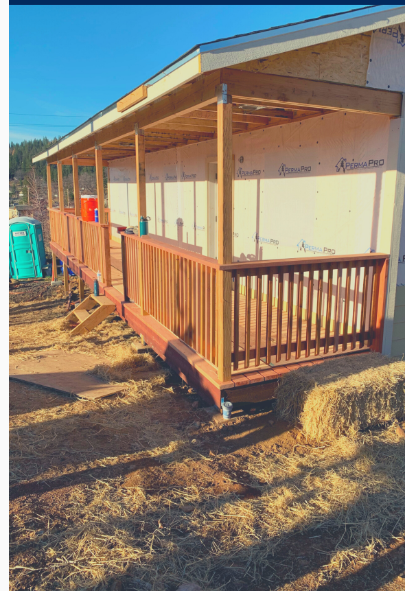
An HCRN home being rebuilt in Northern California

Follow us at: facebook.com/ HopeCityNorCal